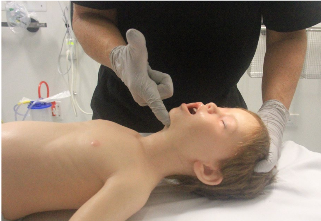
Figure 2: Head tilt with chin lift in a child (sniffing position)