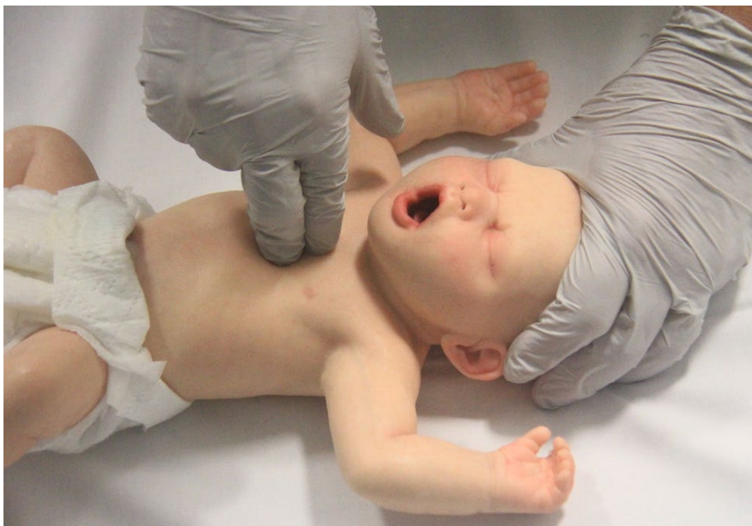
Figure 9: Two-finger compression technique in an infant