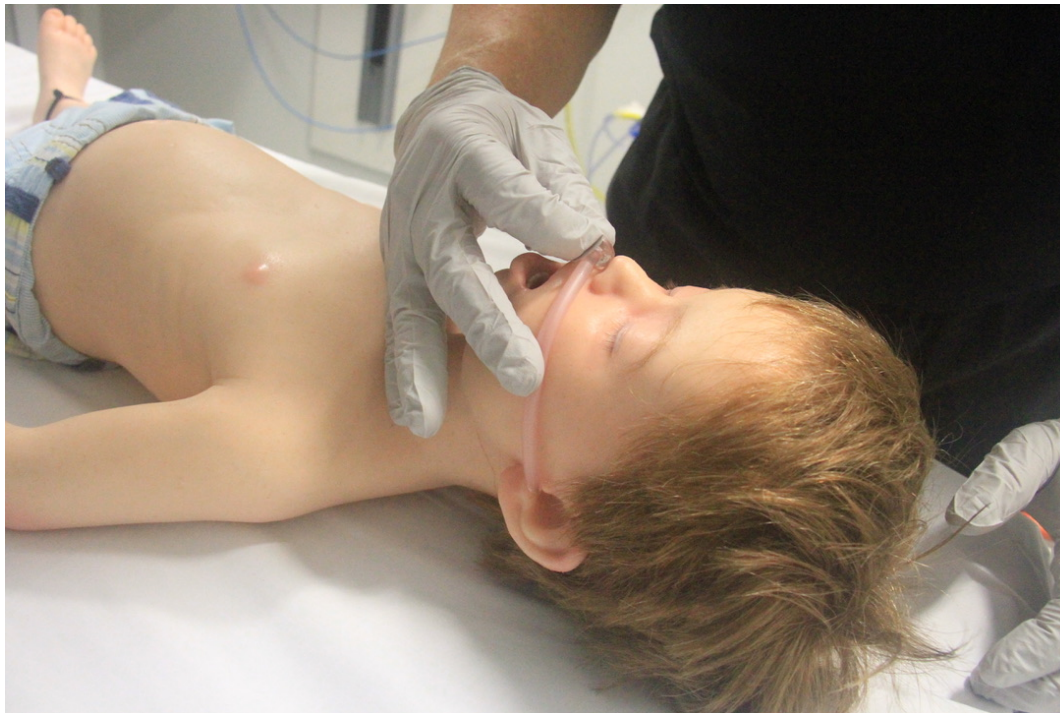
Figure 6: Sizing of naso-pharyngeal tube