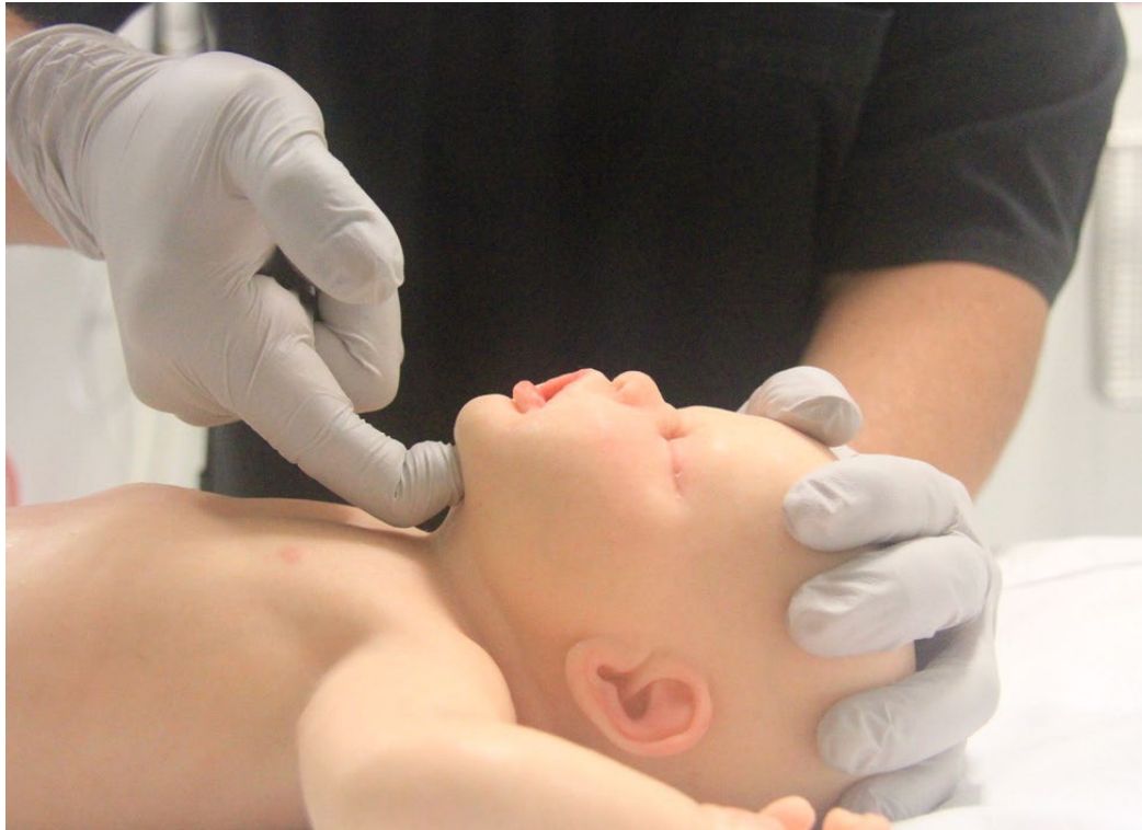
Figure 1: Head tilt with chin lift in an infant (neutral position)

The patency of the airway should be assessed by observation of movement of the chest and abdomen during breathing. An indrawing of the chest wall and/or distension of the abdomen with each inspiratory effort without expiration of air implies an obstructed airway.