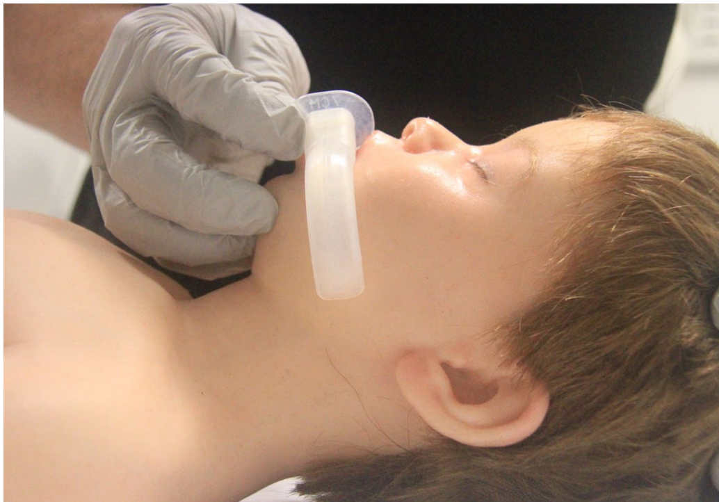
Figure 5: Sizing of oro-pharyngeal tube