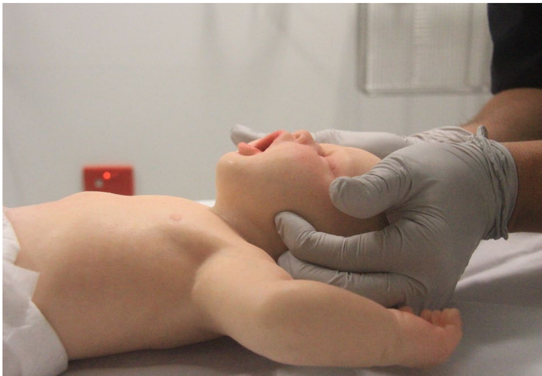
Figure 3: Jaw thrust in an infant