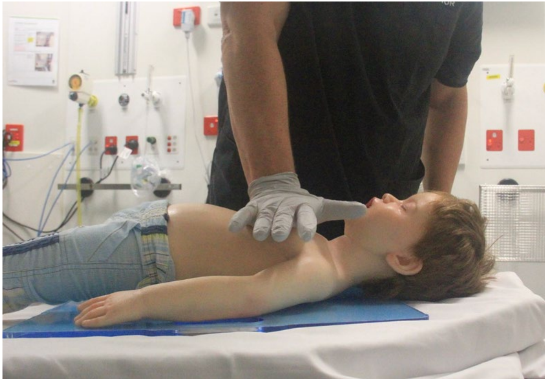
Figure 1: One-handed compression technique in a child

Approximately 50% of a compression cycle should be devoted to compression of the chest and 50% to relaxation to enable full recoil of the chest wall.